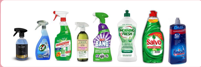
Scheme 3. Samples for house hold industry.

The household chemicals market exceeded 200 billion USD in 2023, with a projected stable growth of approximately 4.50% year-on-year in the coming years.