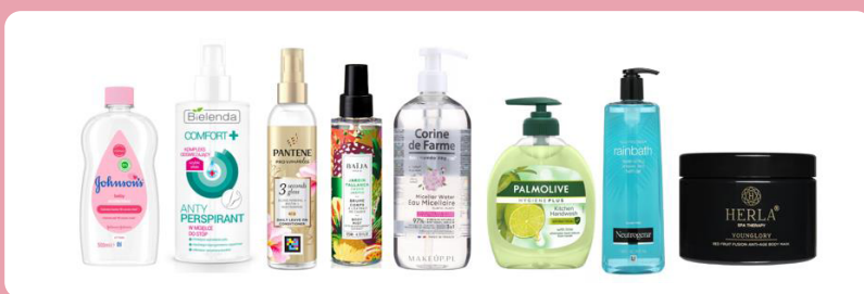
Scheme 2. Samples for cosmetic industry.

The quantities are also counted in tens of millions per year/ bottle. Here, depending on the product and the end customer, the margin levels can be similar or even better than in the case of the JBJ series.