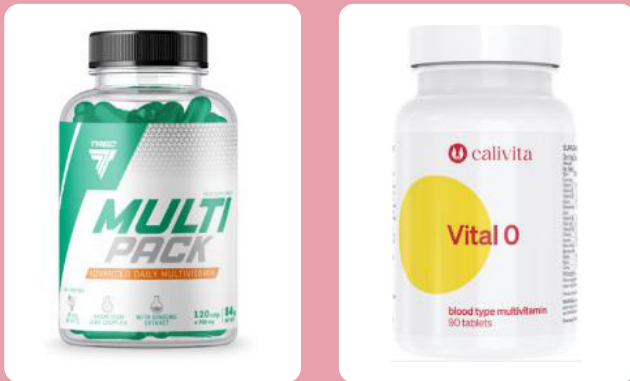
Scheme 6. On the left is a ribbed cap, and on the right is a smooth cap (JCCS)

In line with the principle of full service from a single supplier, we also produce JCCS caps. The JCCS38 and JCCS45 correspond to the 38/400 and 45/400 threads. Over 70% of the caps on the market are smooth, and these are the ones we offer. The thread is standard, screw-on. You may encounter medical, push-on threads, but these are much rarer, and companies are gradually moving away from this solution.