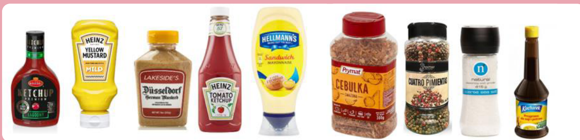
Scheme 1. Samples for food industry.

Food industry - mainly individual projects, packaging made according to customer specifications. Very often, 1 or 2 projects are able to fill the annual capacity of the machine – high volumes, but mostly low margin level. Most popular are bottles for sauce bottles. Since the beginning of ISBM project we have presented many offers, a lot of projects was > 5 mio. pcs. yearly.